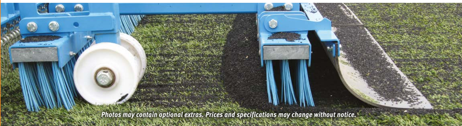
Photos may contain optional extras. Prices and specifications may change without notice.