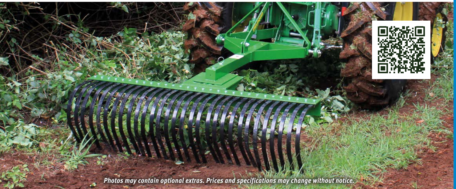
Photos may contain optional extras. Prices and specifications may change without notice.