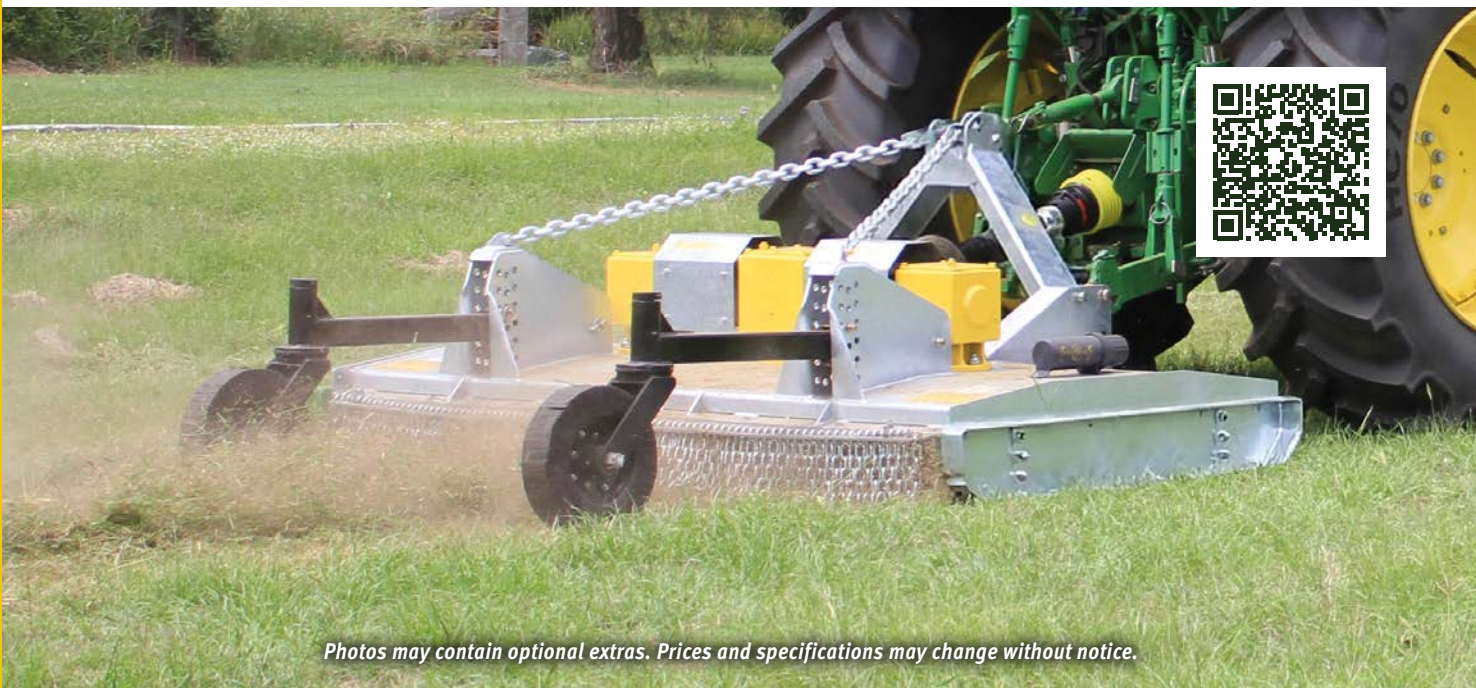
Photos may contain optional extras. Prices and specifications may change without notice.