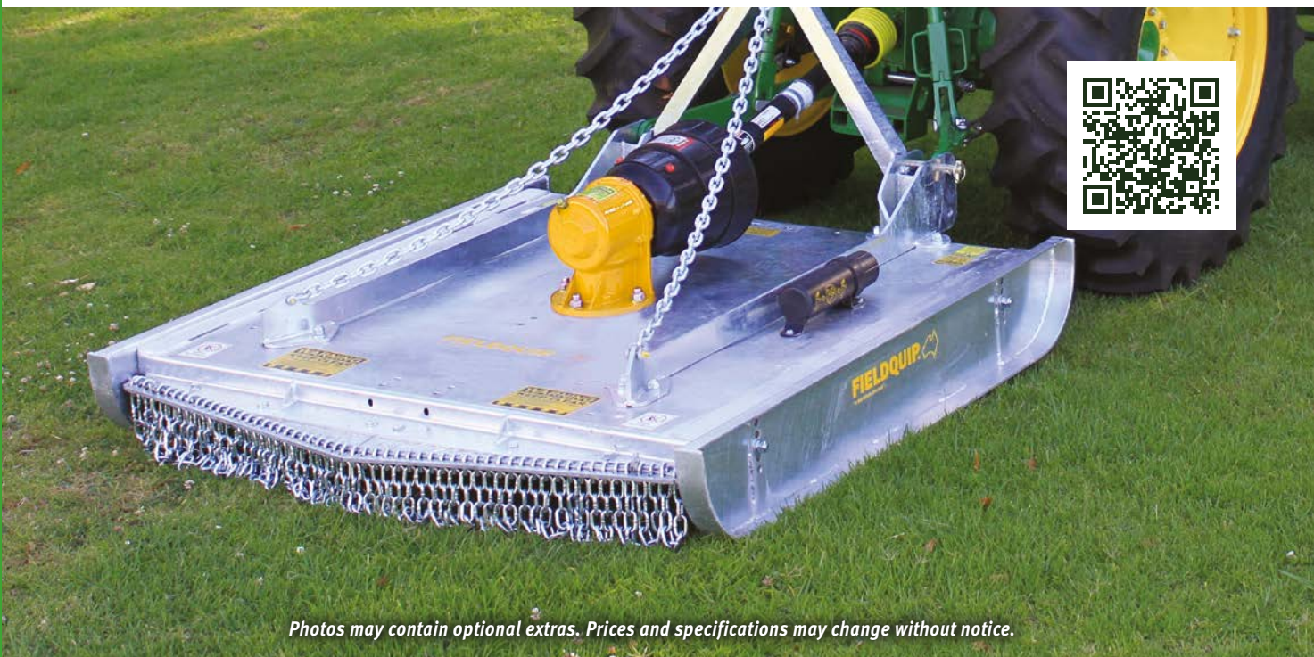
Photos may contain optional extras. Prices and specifications may change without notice.